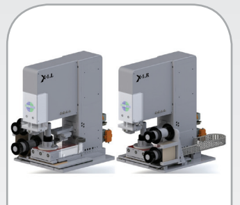
Multiple Tape Options

Sicotech A/S Rødebrovej 17 DK-7600 Struer Denmark