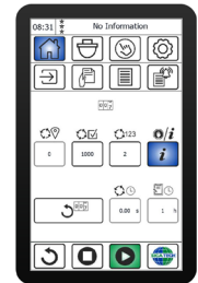
X-Control™ 5" Touch Screen